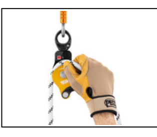
The rope can be installed with the device connected to the anchor.