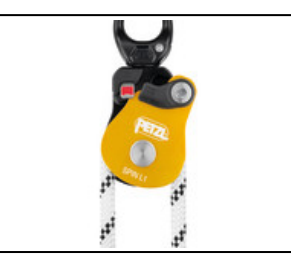
The red mark provides a visual warning when the moving side plate is unlocked.