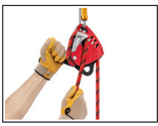
The ergonomic handle and integrated brake allow for comfortably controlled descent.