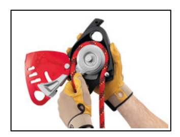
Rope installation is quick and easy, thanks to the markings on the device.