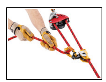
The integrated progress-capture pulley with very large diameter sheave mounted on sealed ball bearings rotates in only one direction for excellent hauling efficiency.